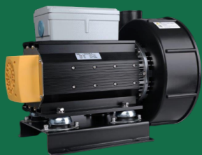
EVEREST TURBO DIRECT DRIVE BLOWER

35-45% ENERGY SAVINGS OVER COMPRESSED AIR DRYING SYSTEMS