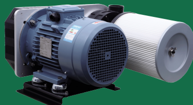
EVEREST TURBO BELT DRIVEN BLOWER