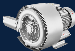
SIDE CHANNEL BLOWER