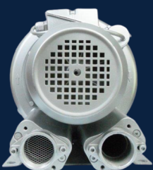
SIDE CHANNEL BLOWER