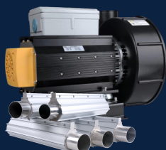
BLOWER AIR KNIFE DRYING SYSTEMS