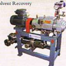
DRY SCREW HIGH VACUUM PUMPING SYSTEMS

For Semiconductor & FPD/Solar Application