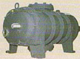
AIR COOLED ROOTS BLOWERS