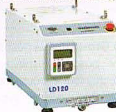
DRY VACUUM PUMPS

For Semiconductor & FPD/Solar Application