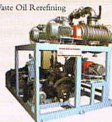
INDUSTRIAL VACUUM SYSTEMS