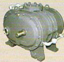
WATER COOLED ROOTS BLOWERS