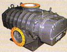
TRILOBE ROOTS BLOWERS