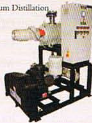
INDUSTRIAL VACUUM SYSTEMS