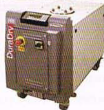
DRY VACUUM PUMPS

For Semiconductor & FPD/Solar Application