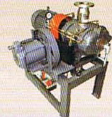
MECHANICAL VAPOR COMPRESSORS