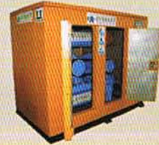
PACKAGE BLOWER SYSTEMS