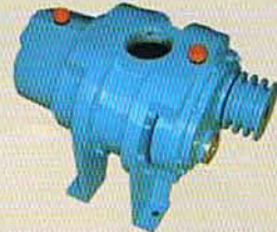
EXPO SERIES ROOTS BLOWERS