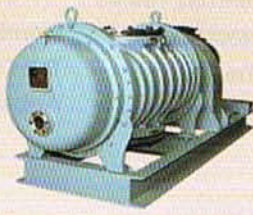
MECHANICAL VACUUM BOOSTERS