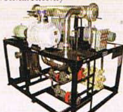
INDUSTRIAL VACUUM SYSTEMS