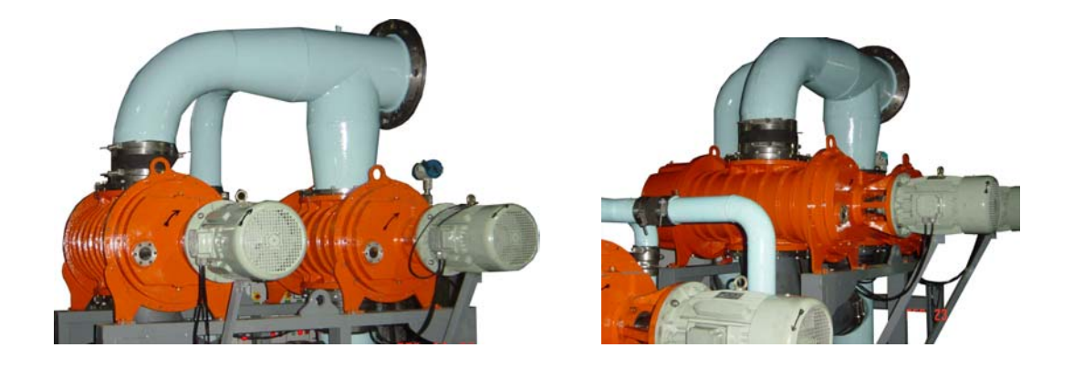
Fig 9 & 10: Everest Vacuum Boosters installed in 1 MLD LTTD Plant in coastal waters of Chennai, Tamil Nadu.

A 10 times larger project of 1.0 Million Litres per day (10 MLD) based on the above LTTD concept is already in advanced stage of erection & commissioning in the costal waters of T.N. Here, Everest has once again extended its expertise & has undertaken the complete design, manufacture & supply of the vacuum system. To improve, additional technique of de-aeration of sea water prior to its admittance in the flash chamber is planned which should result in higher efficiency, yield and low power consumption. All the Vacuum pumping system for de-aerator has also been designed and supplied by Everest. 1 MLD project based on LTTD technique is in the advance stage of erection & commissioning and hope by the time the article is published, final trials would be through.