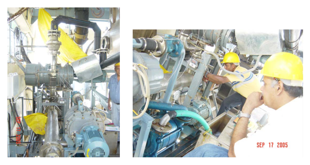
Fig 3 & 4: Everest Vacuum System for LTTD installed at Kavaratti (Lakshadweep)

pumped used in the condenser can subsequently be used for air conditioning as the return temperature of this water is around 17°-18°C. This water being pumped from the lower levels of the sea is rich in minerals & plankton and when discharged on sea surface becomes a potential breeding area for fish and other marine life.