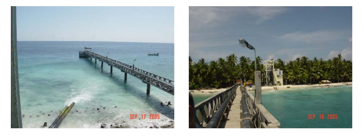
Fig 7 & 8: Actual Site Photographs of LTTD Plant installed at Kavaratti (Lakshadweep)

Everest has been proud to be associated with this project. Vacuum experts at Everest have designed and manufactured complete vacuum system capable of handling total non condensable & carry over water vapour load maintaining system pressure of 25 mbar. Everest .....leaders in Vacuum technology and manufacturers of Dry Mechanical Vacuum Boosters once again proved their capability to design, manufacture and deliver a vacuum system to meet the stringent needs of Indian scientists. We wish to thank our scientists for putting into actual use of concept, known for a long time but never attempted before.