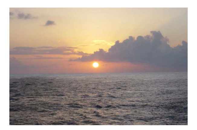
Fig 1: Sea Water at Kavaratti (Lakshadweep)

Fresh water is an essential requirement of mankind for drinking, agriculture & Industrial purpose & is amongst one of the most important input for man's survival. The rapid increase of world's population and non uniform distribution of potable water has forced mankind to develop new techniques to generate potable water. Fresh water rivers, lakes & other natural sources are not able to meet the over growing demand of potable water forcing the scientists to look towards the sea to fulfill the need of fresh water.