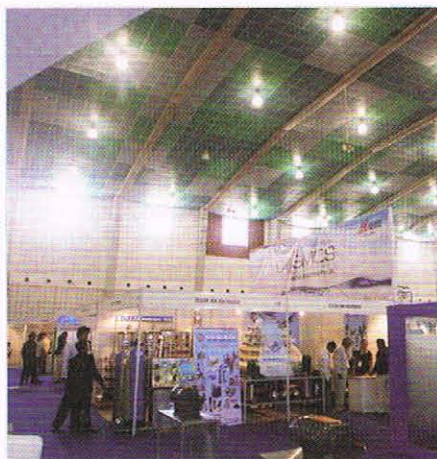
A view of the India Water Expo 2012, held at Ahmedabad from March 1 to 3

As 'water' is becoming one of the scarce resources, several technologies are coming up to ensure efficient handling and management of it. Many users and manufacturers successfully exchanged their ideas in the event.