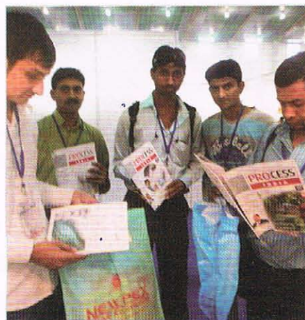
Enthusiastic visitors are scanning through the pages of PROCESS India in the Vogel Business Media's stall.

The conference, based on the theme 'Clear Solution to Clean Water' turned out to be a nice brain-storming platform, where attendees from various industries learnt about the latest applications available in the water and waste water treatment industry. Beside the main conference, some workshops were also conducted to disseminate knowledge on 'Designing of Domestic and Industrial RO Systems', 'Designing, Operation and Maintenance of ETP & STP', and 'Rural and Drinking water management.'