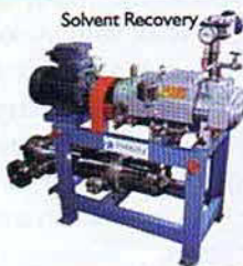
DRY SCREW HIGH VACUUM PUMPING SYSTEMS