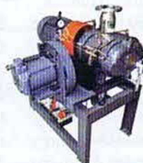
MECHANICAL VAPOR COMPRESSORS