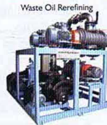
INDUSTRIAL VACUUM SYSTEMS