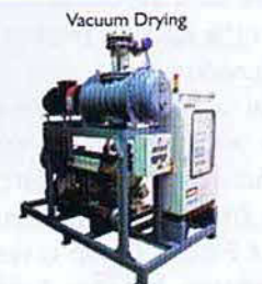
INDUSTRIAL VACUUM SYSTEMS

Roots Blowers | Mechanical Vacuum Boosters | Dry Vane Pumps | Acoustic Hoods | Industrial Vacuum Systems