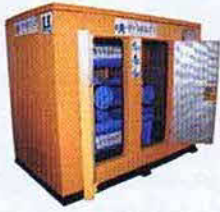
PACKAGE BLOWER SYSTEMS