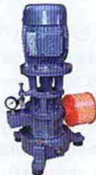
VERTICAL TRILOBE ROOTS BLOWERS