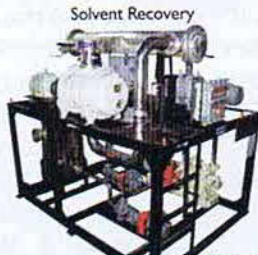
INDUSTRIAL VACUUM SYSTEMS