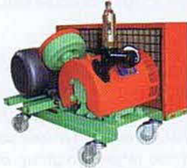
DRY VANE PUMPS