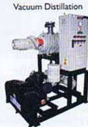
INDUSTRIAL VACUUM SYSTEMS