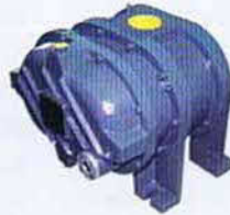
AIR COOLED ROOTS BLOWERS