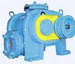
AQUA SERIES ROOTS BLOWERS