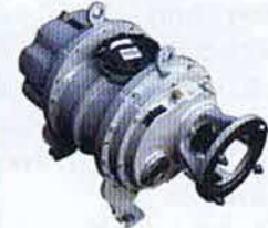
MECHANICAL VACUUM BOOSTERS