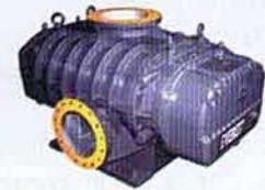
TRILOBE ROOTS BLOWERS