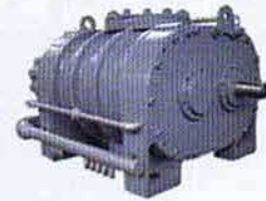
WATER COOLED ROOTS BLOWERS