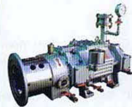
DRY SCREW VACUUM PUMPS