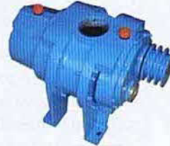
EXPO SERIES ROOTS BLOWERS