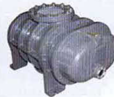
GAS-BIOGAS ROOTS BLOWERS