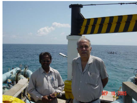
Fig 5 & 6: Everest's Technical Team in close interaction with Indian Scientists at LTTD Plant in Kavaratti (Lakshadweep)

LTTD method of producing fresh water from sea water consists of flash evaporator, main condenser, fresh water & warm water pump and a vacuum pumping system. Since the major equipment is static the entire project requires low maintenance, having long operational life (Refer schematic diagram). The surface sea water is pumped into the