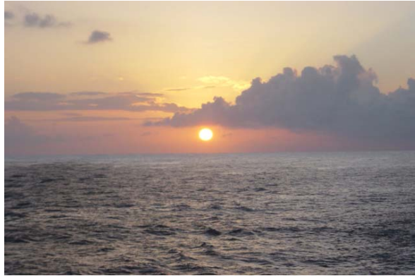
Fig 1: Sea Water at Kavaratti (Lakshadweep)

Fresh water is an essential requirement of mankind for drinking, agriculture & Industrial purpose & is amongst one of the most important input for man's survival. The rapid increase of world's population and non uniform distribution of potable water has forced mankind to develop new techniques to generate potable water. Fresh water rivers, lakes & other natural sources are not able to meet the over growing demand of potable water forcing the scientists to look towards the sea to fulfill the need of fresh water.