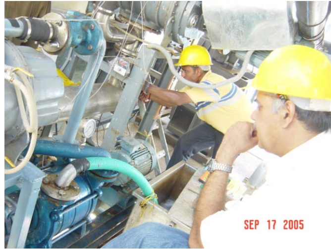
Fig 3 & 4: Everest Vacuum System for LTTD installed at Kavaratti (Lakshadweep)