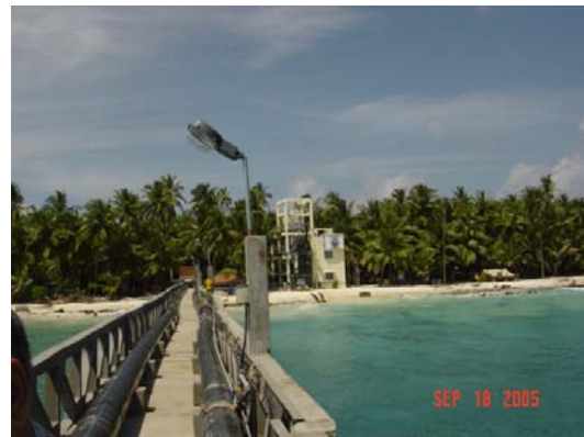
Fig 7 & 8: Actual Site Photographs of LTTD Plant installed at Kavaratti (Lakshadweep)

Everest has been proud to be associated with this project. Vacuum experts at Everest have designed and manufactured complete vacuum system capable of handling total non condensable & carry over water vapour load maintaining system pressure of 25 mbar. Everest .....leaders in Vacuum technology and manufacturers of Dry Mechanical Vacuum Boosters once again proved their capability to design, manufacture and deliver a vacuum system to meet the stringent needs of Indian scientists. We wish to thank our scientists for putting into actual use of concept, known for a long time but never attempted before.